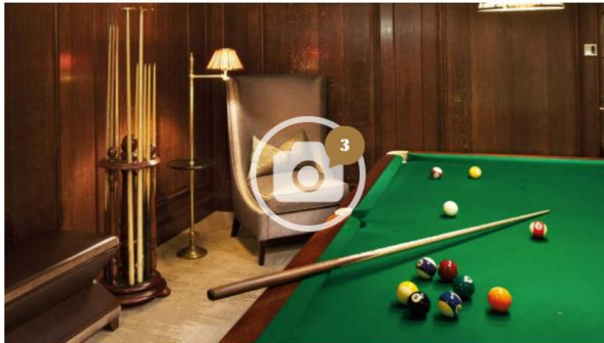
Description : Billiard room at Ten Trinity Square Private Club

The Club shares its home with the Four Season's Hotel, which has its benefits: cuisine comes courtesy of on-site La Dame de Pic, which has picked up a Michelin star within its first year of opening, while members can relax in the expansive spa, complete with indoor swimming pool, hammam, steam room and high-tech fitness centre.